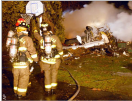
GRIM SCENE: Firefighters in upstate Clarence monitor the site of the Continental Connection Flight 3407 crash, in which icing is being eyed as the primary cause.